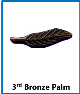
3 rd Bronze Palm